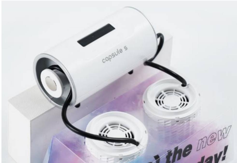
<How to use multipurpose sterilization kit>

Sterilize your daily use belongings with our multipurpose sterilization kit.